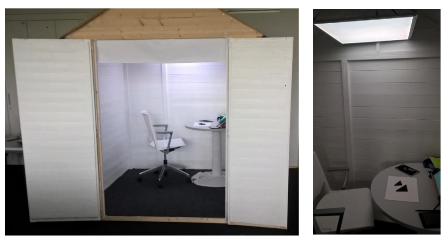
Figure 2. Cube design for lighting experiment and position of lighting instrument

chair and one circle desk were in white to optimize visual focus on object concerning the lighting. The carpet was in dark color, but actually were not visible to the respondent when seated. The lighting instrument placed in the ceiling of cubes which is operated from the outside by lighting software application.