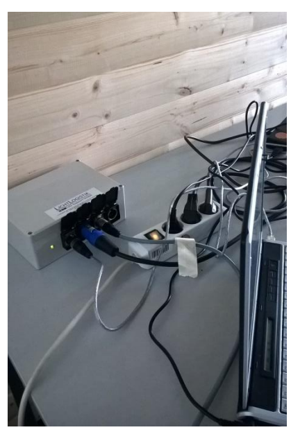
Figure 3. Lighting software and its hardware support